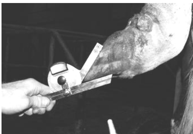
Figure 2. Measurement of the claw angle with a goniometer

To give the cows the opportunity to adjust to the new environment, they were guided several times through the experimental setup. Subsequently, each cow was tested individually according to the following protocol: First, cows were guided to walk through a six meter long corridor, on a recently roughened slatted concrete floor (fig 1;C) while their gait was filmed with a digital video-camera (fig. 1;A). Secondly, the cows were guided into a box of 1 * 2 m 2 (fig. 1;D), the hind legs were positioned on top of the RSscan ® pressure mat and the pressure signature of the claws of both hind legs was recorded. Finally, the cows were guided into a trimming chute (fig. 1; E) to examine the claws of both hind legs for any kind of disorder. Photographic pictures of the claws were taken from several sides and the claw angle was measured using a goniometer (fig. 2). The cow's weight was measured in a cow balance (fig. 1;B) during week six.