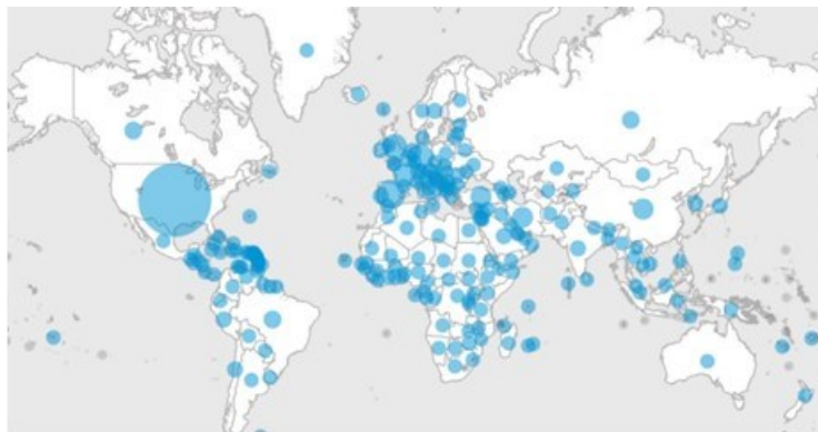
Corona-virus-map, worldwide spread, WHO