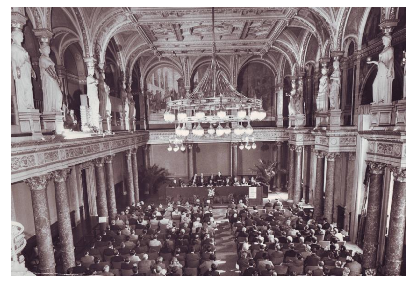
The first plenary session

He demonstrated the mutual interactions between development of animal hygiene as science and practice of modern husbandry systems. He had foreseen that large-scale production had been and remained the engine of the agricultural progresses. Summarising the then available information he nailed down: genetic progress is accompanied by the parallel increase of housing, nutritional and other relevant requirements of domestic animals and poultry. Disregarding these connections sets basis for development of multifactorial diseases. He introduced the concept of "living environment" and demonstrated the necessity of its balance with the defence mechanisms of animals. Dealing with the connections be-