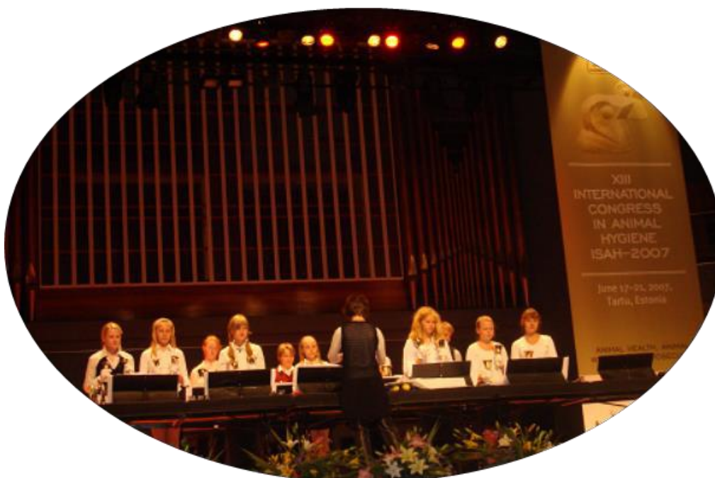
The lovely choir entertains the audience of the Opening Ceremony in Tartu in 2007