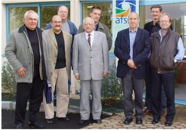
EB meeting in Ploufragan, France, 2004.