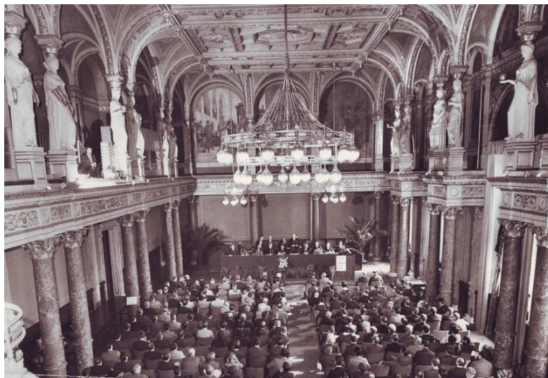
The first plenary session

He demonstrated the mutual interactions between development of animal hygiene as science and practice of modern husbandry systems. He had foreseen that large-scale production had been and remained the engine of the agricultural progresses. Summarising the then available information he nailed down: genetic progress is accompanied by the parallel increase of housing, nutritional and other relevant requirements of domestic animals and poultry. Disregarding these connections sets basis for development of multifactorial diseases. He introduced the concept of “living environment” and demonstrated the necessity of its balance with the defence mechanisms of animals. Dealing with the connections between animal behaviour, housing and development of abnormal behaviour, he stated: “Be-